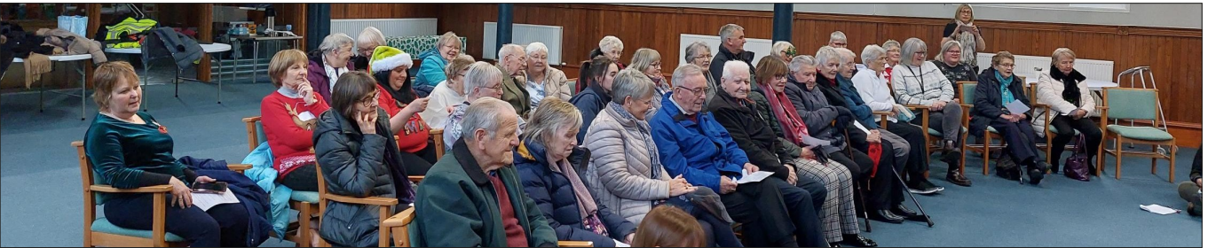
Café entertained by P1 Ladyloan children, followed by Party